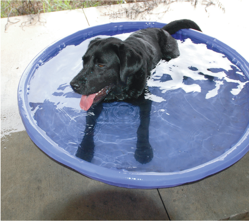
Photo: A search-and-rescue dog in training takes a break in a wading pool in Orlando, Florida, June 2005. Taken by Leif Skoogfors. Released into the public domain by FEMA.

After a snowy winter and a rainy spring, most people are happy for the hot temperatures of summer. In many parts of the country, school is out. You can do things in the summer that you can't do when it's cold. You can plant a garden. You can spend an afternoon at the park. You can have a cook-out with your family. You can go swimming and play baseball. Summer is a time for being outdoors.